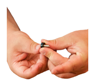
Prepare Rack Screws for installation by inserting the Washers on to the Rack Screws. Install (4) Cage Nuts in the corner holes of the Side Frame. Then install (2) Cage Nuts onto the front