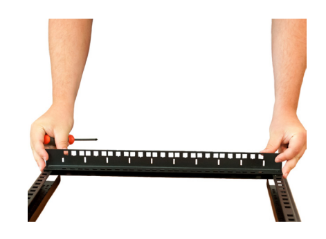
Align the Rack Rails to the side panel so that the screw holes match up to the Cage Nuts. Tighten the Rack Screws into the Cage Nuts. Repeat for the second Side Frame and two remaining Rack Rails.