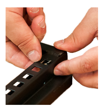
Frame. Then install (2) Cage Nuts onto the front facing ports of the Side Frame. Repeat for second Side Frame.