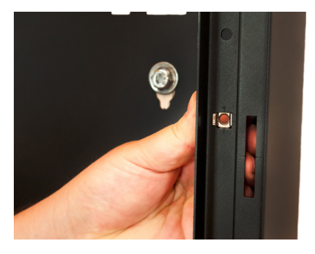
Install (2) Cage Nuts on each side of the Back Panel.